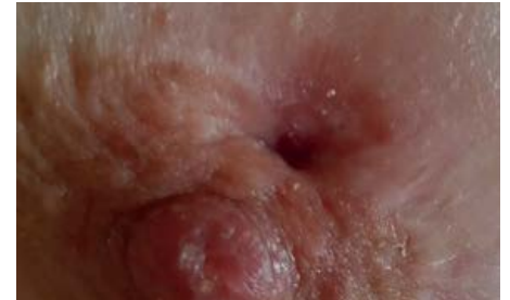
At the start of therapy

Reprinted with the permission of Wounds UK . This case study was originally published in a Round Table Discussion Document: Using NANOVA™ Therapy System in Practice: a round table discussion. London: Wounds UK . 2014.