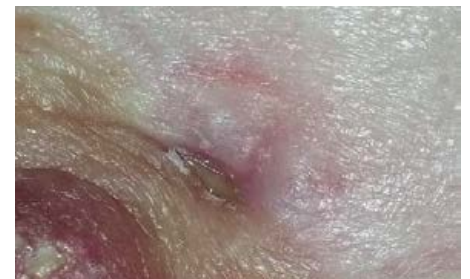
At week 3