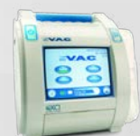
Figure 2. NPWT-B