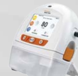
Figure 4. NPWT-D