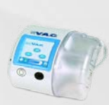
Figure 1. NPWT-A