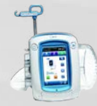
Figure 3. NPWT-C