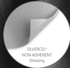
SILVERCEL® NON-ADHERENT Dressing