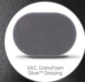
V.A.C. GranuFoam Silver™ Dressing