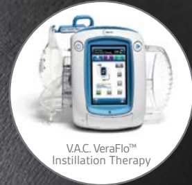
V.A.C. VeraFlo™ Instillation Therapy